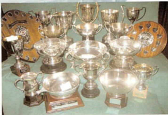
Trophies competed for today