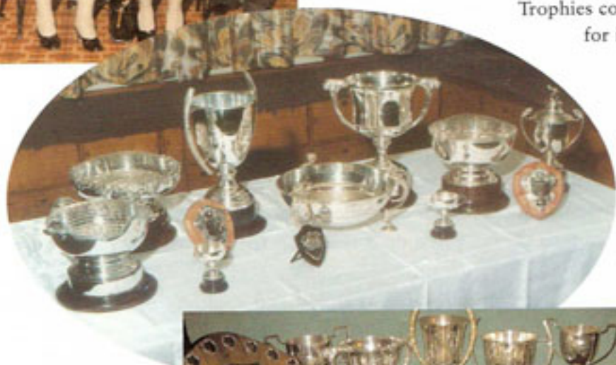
Trophies competed for in 1980