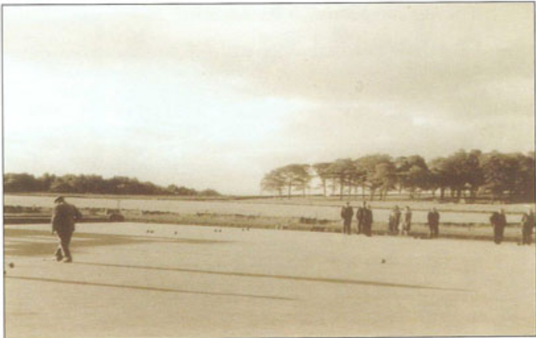
Our green in 1956