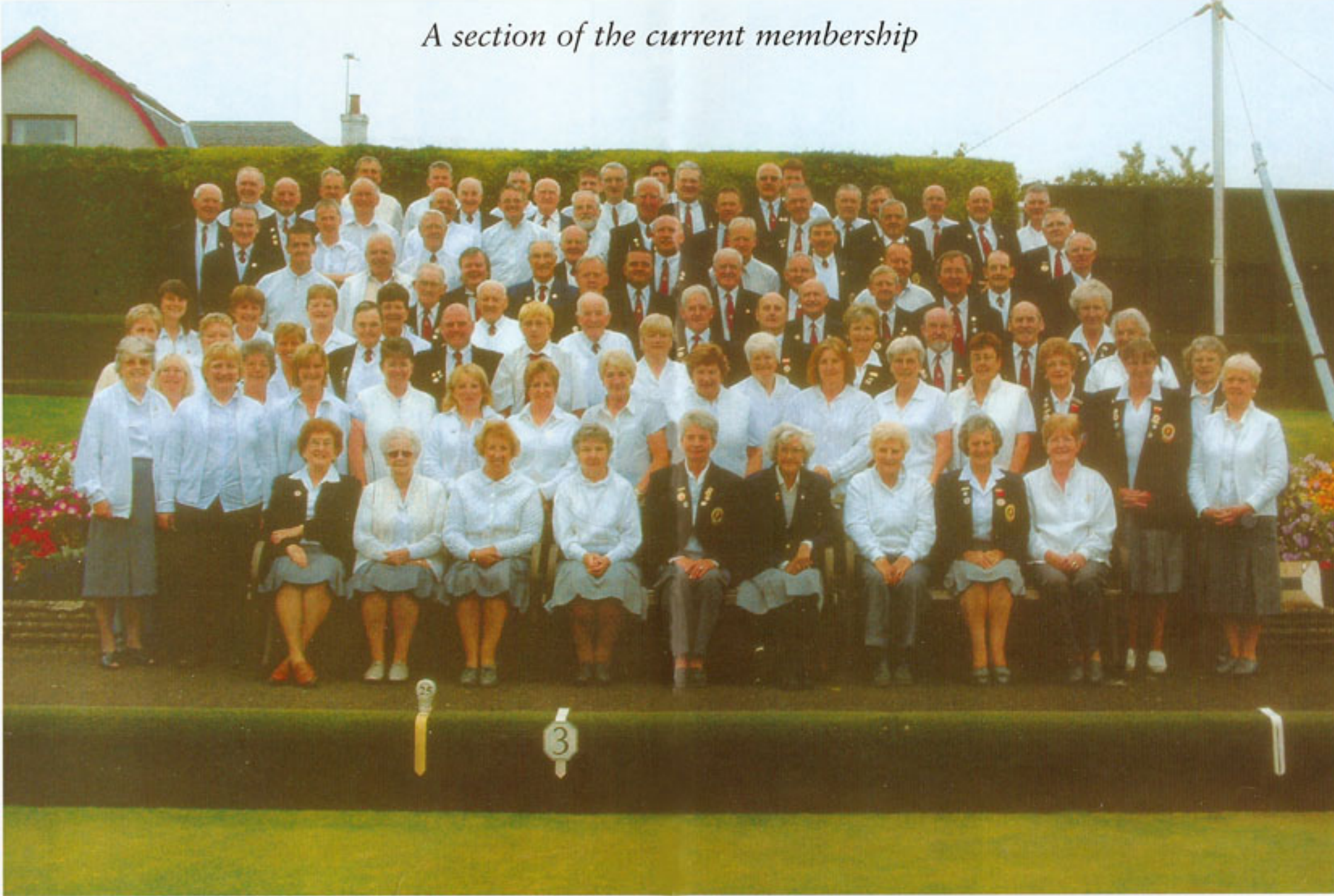
A section of the current membership