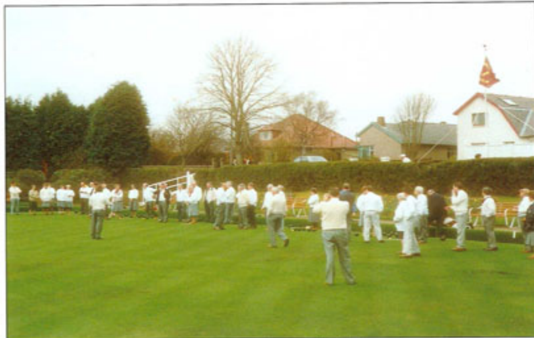
Our green as it was in 1989